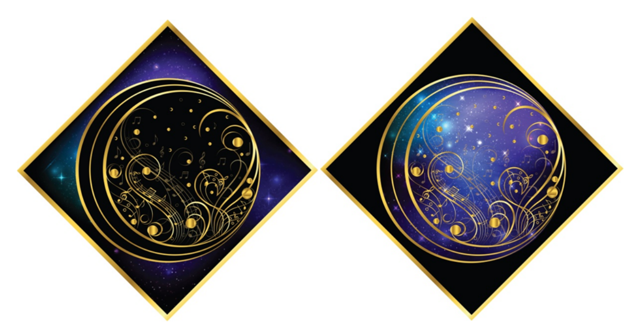
Figure 2. When I miss you I will see the sky, Designed and created by Porhathai Soonsan (2017)