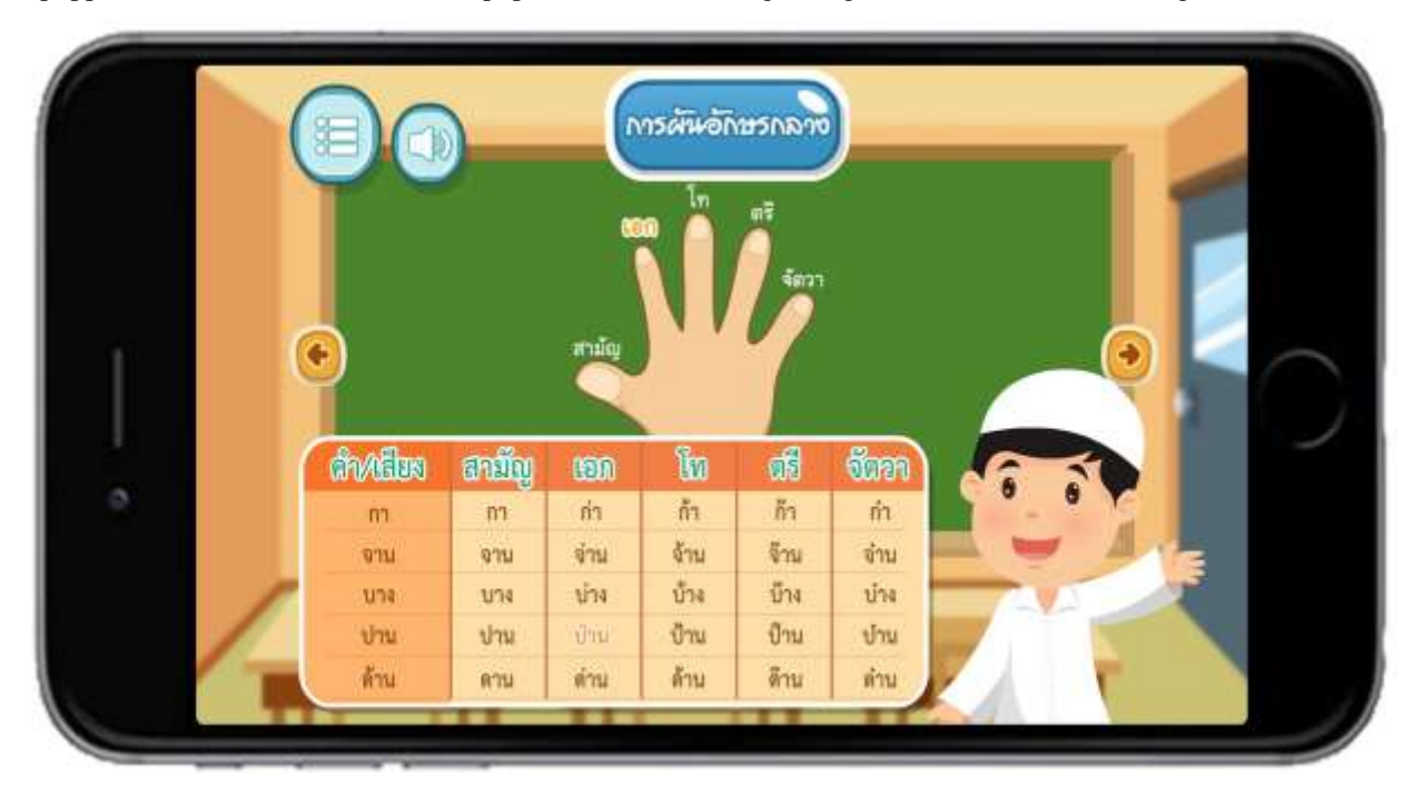
Figure 1: A Screenshot of the Mobile App for Thai Language Learning

Among several types of mobile apps for learning, this app design was based on a multimedia learning concept applied with Thai intonation marks. The main content of the app was Thai intonation marks containing five tones: low, mid, high, falling and rising. Figure 1 shows a hand with five animated fingers in which each finger was equipped with sound so that it enabled pupils to move their fingers together with the animated fingers in real-time.