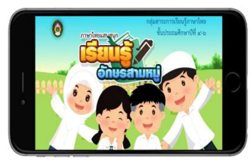
Figure 2: The Illustration of Multi-Cultural Characters of Pupils

Furthermore, we also developed the mobile app based on mobile-assisted language learning principlesas showed in Table 1.