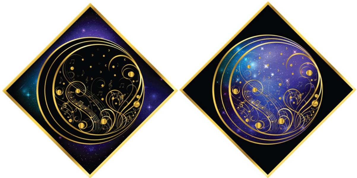
Figure 2. When I miss you I will see the sky, Designed and created by Porhathai Soonsan (2017)